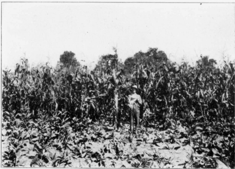
Harrow Experimental Station. A good crop of corn.