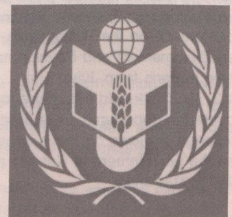
Logo of the World Disarmament Campaign