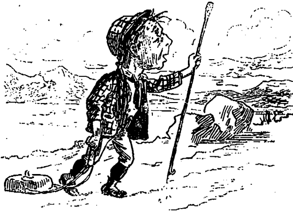
II.—MR. DAWDLE RECUPERATING WITH PLEASURE.

BUSINESS Education is very essential to the success of every young man and young woman. Good book keepers are constantly in demand by Business men.