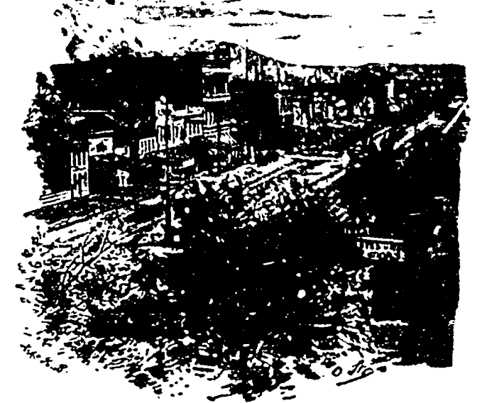
STREET IN SALT LAKE CITY.

capital are of goodly size and style, but