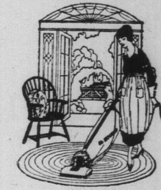
The Hoover is guaranteed to prolong the life of rugs.

Are you tired at the end of sweeping day? It is no wonder that such effort saps your energy.