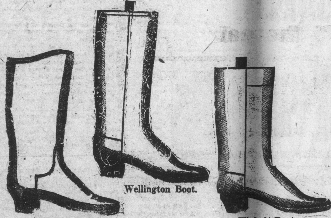
Tongue Boot. Wellington Boot. High 3/4 Boot.

FISHERMEN! Buy Smallwood's Leather Boots. They wear longer and are more healthy than Rubber Footwear. Leather Boots are warmer and more comfortable to walk in than Rubber Boots.