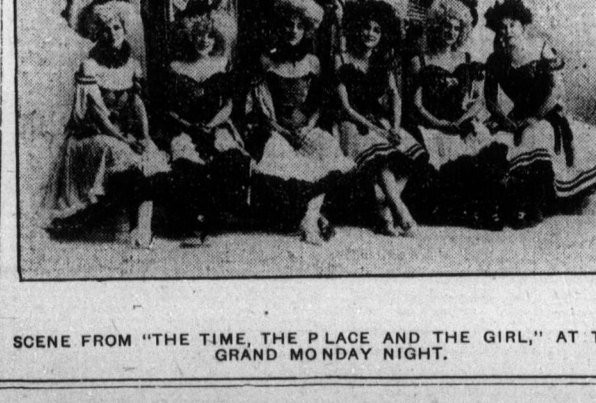
SCENE FROM "THE TIME, THE PLACE AND THE GIRL," AT THE GRAND MONDAY NIGHT.