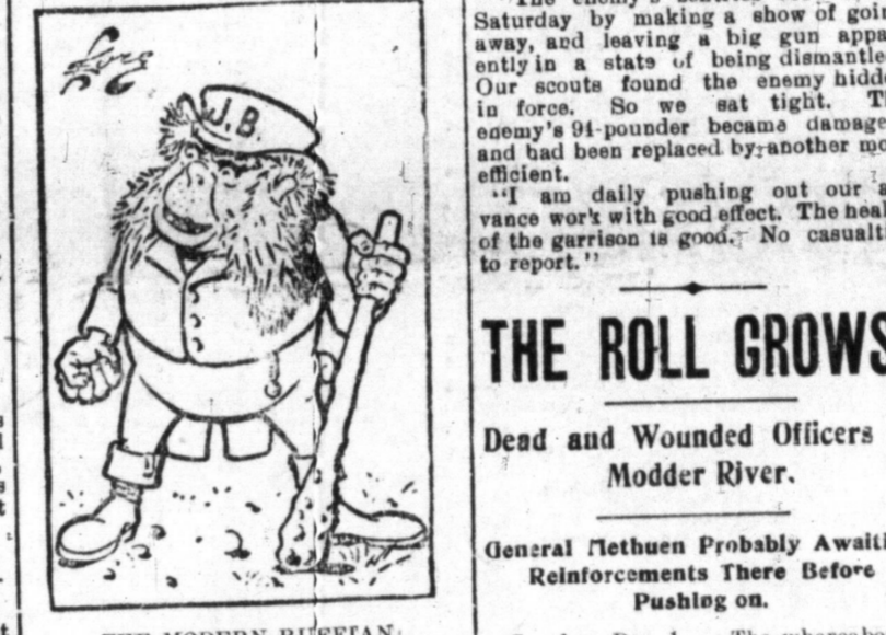
THE MODERN RUFFIAN. A Cartoon from the Norse Vremya.

was regarded as merely one of the numerous Boer tricks to draw our men out by inducing us to believe that the relieving forces are drawing near. This afternoon the rifle bullets on the railway line towards Spytfontein. The news of the advancement of the relieving forces greatly cheers the garrison, and the inhabitants. A few Boers were seen to-day, but it is believed the enemy is in only small bands around Kimberley, lots of 50 or so, the greater part having gone to Spytfontein. Here fighting is believed to have been heard about noon. The official estimate places the number of Boer shells fired during the bombardment of Kimberley at about 1,000, and ours at no fewer than 600. As the enemy's shells so frequently hit soft sandy ground, the explosive effect is greatly neutralized. All our wounded are in very satisfactory condition. An armored train proceeded toward Dronfield to reconnoitre, but this immediately aroused the enemy's cordite gun, and the train been fired. The Boers are firing on the reservoir from Wimbledon.