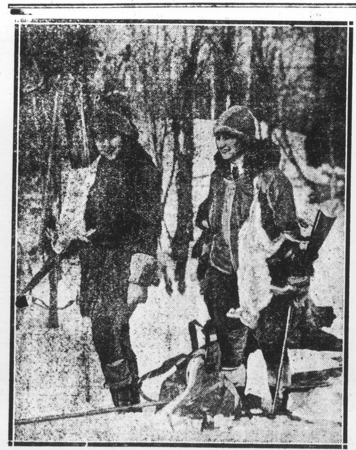
A FAIR PAIR AND TWO BRACE Just before the fire was built for the rabbit stew, not a thousand miles from Quebec. You go after these-the rabbits-on skis or snowshoes.

those countries, have, of course, exist- is a given name derived from the ed for a great many generations only words of "love" and "theyne" (follower as family connections. As political or soldier), but the actual meaning of and social structures they have suc- the name was "beloved soldier."