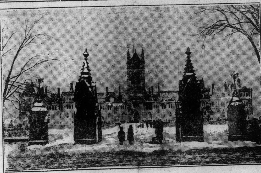
The Parliament Buildings as they now appear. This picture was taken on Tuesday just outside the main gateway, and shows the roofless walls, blackened in places, and white with a coating of ice in others.