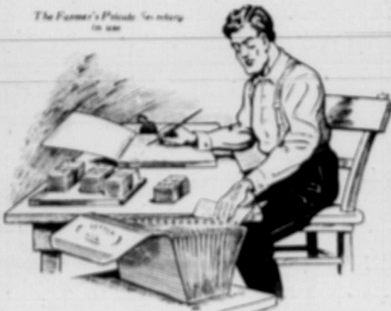
The Farmer's Private Secretary in use

One Letter File, like the picture, 11 1/2 by 9 1/2 inches, with a pocket for each letter of the alphabet. This file when closed is only 1 1/4 inches thick, but it opens like an accordion and will hold 1,000 letters. Made of tough paper reinforced with linen. It will last 20 years if handled with care.