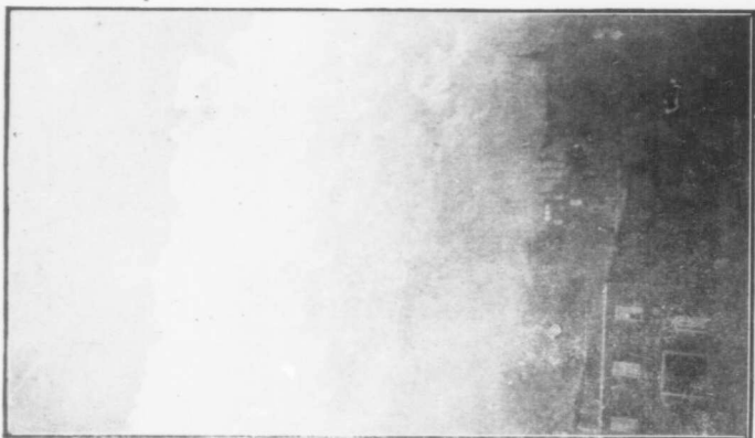
This picture was taken at the corner of Queen and Green Streets, three miles from the scene of the disaster, a few minutes after the explosion, and shows the cloud of smoke from the explosion.