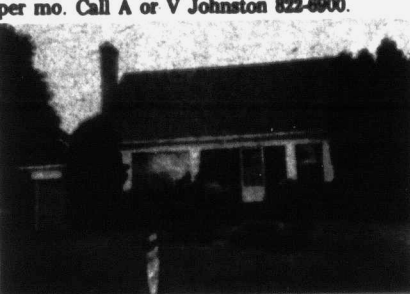
APPLEWOOD PRIVACY - BACKING ONTO GREENBELT

Can be purchased with $3,000 down. Principal interest, taxes fee, eat, utilities, carry for $395 per mo. Call A or V Johnston 822-6900.