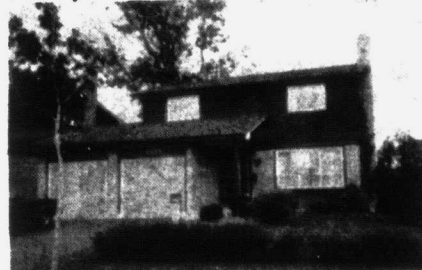
ERIN MILLS 4 BEDROOM BEAUTY. $$$ EXTRAS

$74,900. 3 Large Bdrm, finish rec. rm, conveniently located — close to all main $74,900. - mortgage at 104%. Call Eugene