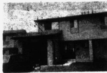
OPEN HOUSE SUNDAY 2-5 7227 JOLIETTE CRESCENT

$96,900. 4 bedrooms, main fir. fam & la 21/2 baths, to see is to love, call Art Rattle 823