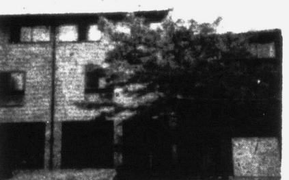
SUNKEN LIVING ROOM WITH CATHEDRAL CEILING

Low down payment - 2 bedrooms, 11/2 baths, broadloom, central air, tastefully decorated. Ruth Parker 279-3432.