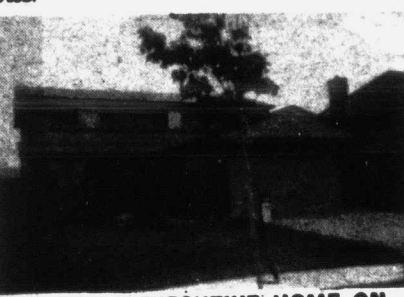
2 STOREY EXECUTIVE HOME ON QUIET COURT

$86,900. Beautiful location, this home offers main floor family rm with open fireplace, 4 bedrms including spacious master with separate ensuite makes this an ideal family home. Call Stuart Mapp 828-1122.