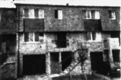
MEADOWVALE TOWNHOUSE SPACIOUS LIVING AREA

Entertain in air cond. comfort, kit. & laundry comb. 5 appliances, 3-4 bedrms, 11/2 baths. To view please call Martha Mcathy 279-8440.