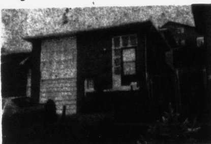
HUGE SEMI $58,900 FOUR BEDROOMS

Four bedrooms family room and more. Jim Rathgeber 279-3432.