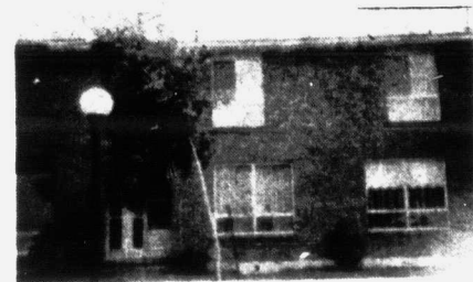
STEPS TO "GO TRAIN" CLARKSON HIGH SCHOOL — $45,900

$78,900 Asking price 4 bedroom detached bungalow, large living, dining area, broadloom, modern kitchen, 2 bathrooms, 2 car garage complete finished basement, mortgage at 104% carries less than rent for more inf. Call J. Panich