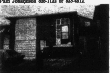
CLARKSON GO TRAIN SPECIAL MUST BE SOLD $4,000 DOWN

Erin Mills, 3 bedrooms, walk to schools shopping & Parks, separate dining room. Call Pam Johannson 828-1122 or 823-4512.