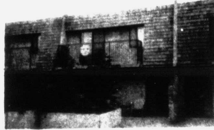
CENTRAL MISS. NEAR SCHOOLS, PARK AND TRANSIT

All drapes sheers built in stove & oven Brdlm over hardwood. Fireplace & bar completes this 3 Bdrm bungalow as a "Move in" Proposition call John Curran 279-3432.