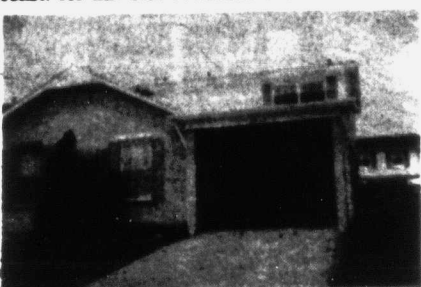
$60,500 — 4 BEDROOMS

3 bedrooms MBR with 4 pcs ens. & walkin cl. fin. bsmnt. walkout to B. Yd. Sound & Fproof conc. const. for inf. call V. Ashkar 279-8440.