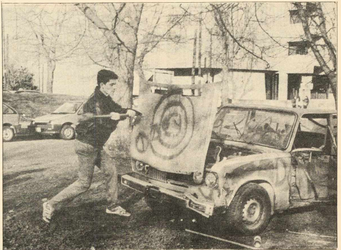
Hit the hood, win a prize.

For more information, or to register, contact the Safety Office at 424-2495.