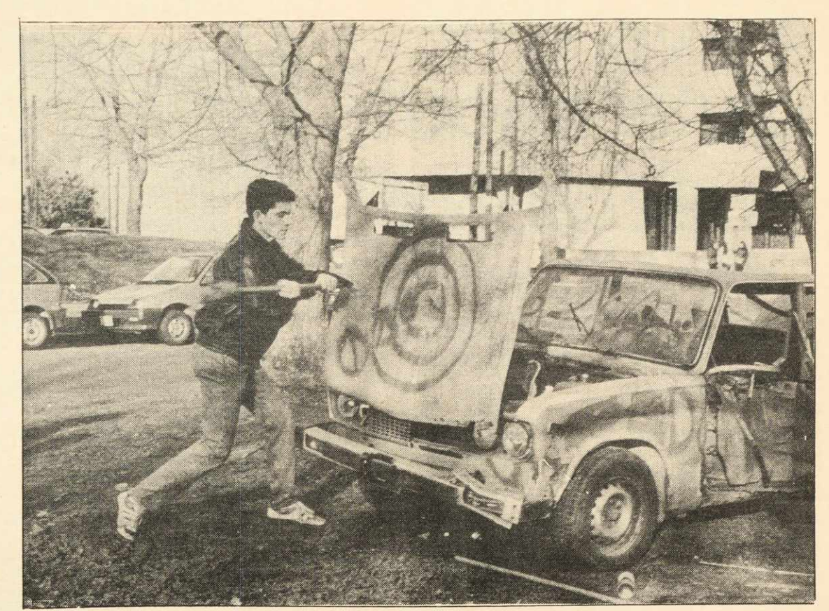
Hit the hood, win a prize.

For more information, or to register, contact the Safety Office at 424-2495.