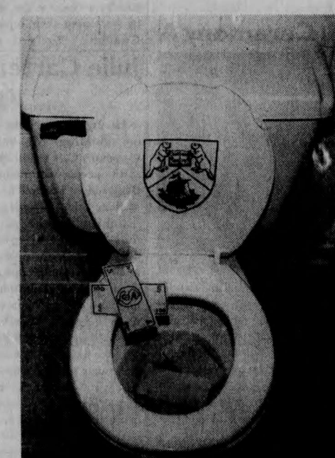
Holy Sewage Batman! The total cost of providing water & sewage removal from UNB is

the province. In the York region, which includes Fredericton, there are 24 35 million characters were completed in the 17th century. The purpose of the branches. UNB spends $6.125 million endeavor was to preserve sacred Buddhist to maintain the libraries on the scriptures from looters and fire. Fredericton campus.