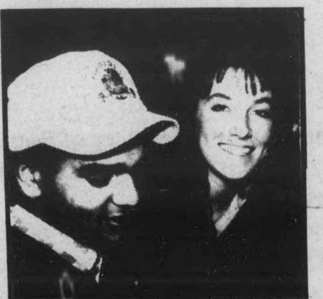
as long as they stay out of Bangladesh, it's fine with us.