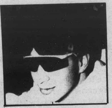
T.J. - Yes! Noriega called Bush a sphincter