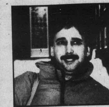
NO! the US are bullies If they did it to protect innocents