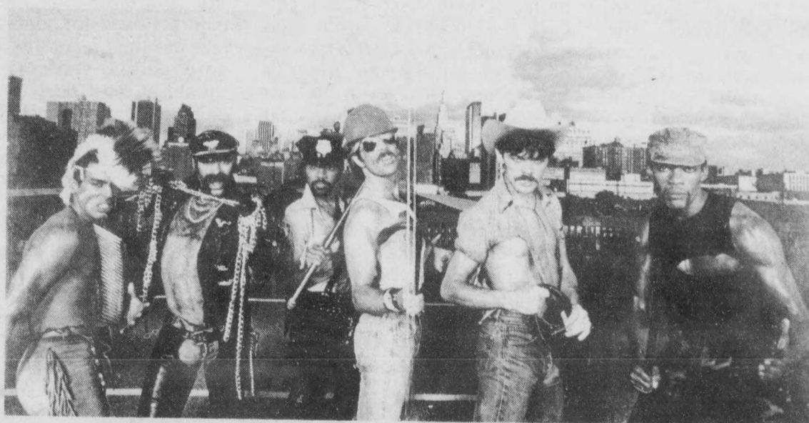
The Village Queers