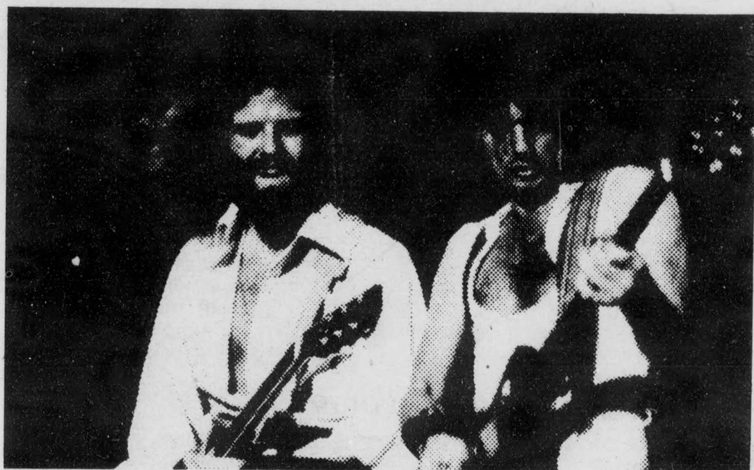
April Beer in live performance