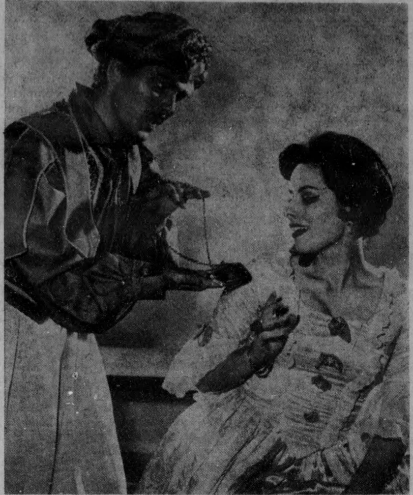
"Are you sure there are no strings attached?"