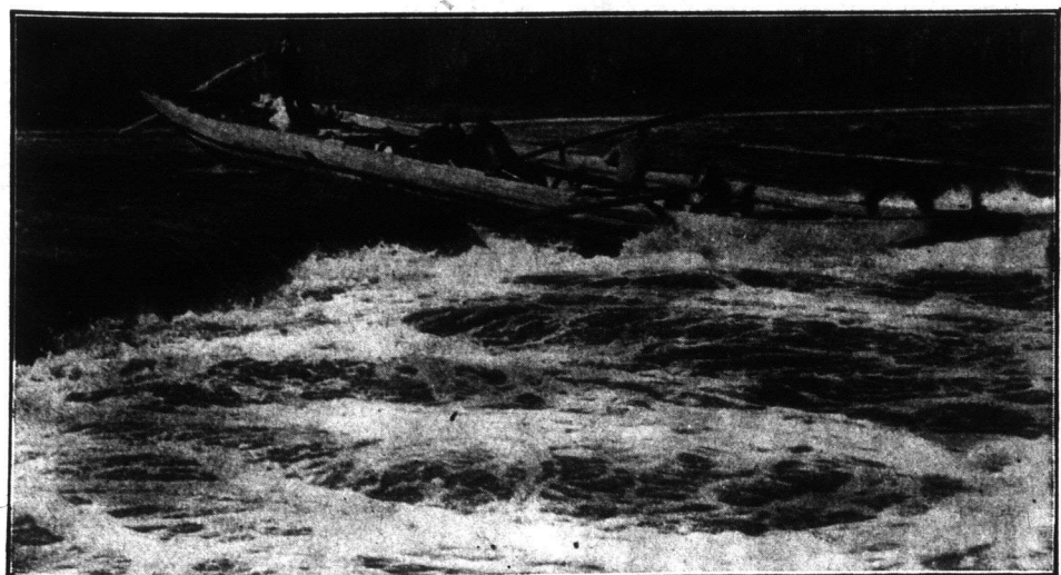
Shooting Rapids on the Athabasca River. There are ninety miles of them between the landing and McMurray

rapids, and running the full length so that both ends touch on fairly calm water, is a strip of land known as Grand Island. This strip offered a safe and easy portage for the goods and to carry them a railroad was built by the Hudson's Bay Company. It is the shortest one in the world, a scant quarter of a mile in length. It is built of strap iron laid on wooden rails and ties. It carries no passengers. Its freight rate is $2.50 per ton payable in advance, every man handling his own. One man attends to all departments so, unhampered by the weight of expenses of trainmen, section hands, presidents and boards of directors and other costly necessities that are the profit reducers of other lines, this little road has flourished and at the end of this year showed a net profit of a million dollars to the company on an original outlay of about a thousand. Its rolling stock is two battered lorries (flat cars) the motive