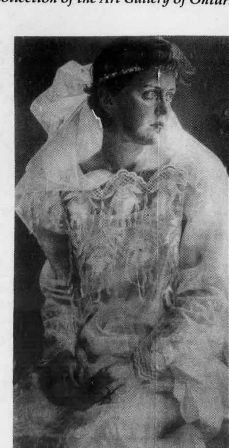
BARBY IN THE DRESS SHE MADE HE oil on panel, 90.8 x 60.3 cm Private collection

P.S. (See her work and buy the book at the Beaverbrook Art Gallery. The exhibition which opened on September 17 runs until November 12. It's a free presentation and open to the public.)