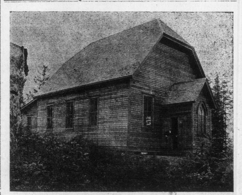
NEW CHEMAINUS CHURCH.

ing to the law. (4) In towns or villages no insurance office shall be established (sic). Failing