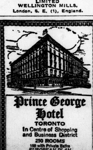
Prince George Hotel TORONTO In Centre of Shopping and Business District 250 ROOMS 100 with Private Bath EUROPEAN PLAN

John Oakey & Sons LIMITED WELLINGTON MILLS, London, S. E. (1), England.