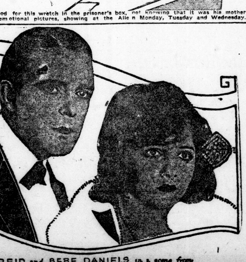
WALLACE REID and BEBE DANIELS in a scene from "THE DANCING FOOL," A PARAMOUNT AIRCRAFT PICTURE

Feature attraction at Loew's next Thursday, Friday and Saturday.