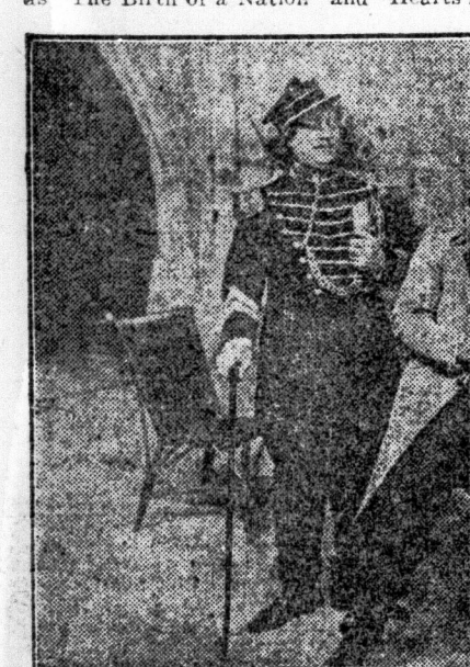
Scene from "The Birth of a Nation," which comes to The Grand for three days, Thursday, Friday and Saturday, November 11th, 12th and 13th.