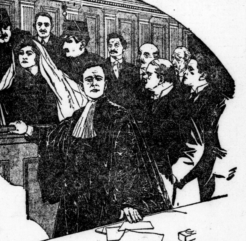
He pleaded with his heart's blood for this watch in the prisoner's box, not knowing that it was his mother—the big scene of that greatest of all emotional pictures, showing at the Allen Monday, Tuesday and Wednesday.

Today Wallace Reid can't play music the way it is written. But oh, boy! he can certainly jazz it off by ear, as anybody in the Lucky studio who has ever heard him operating on his saxophone can testify. Wallace Reid is the champion saxophonist of the west coast. He has a jazz band all his own, which