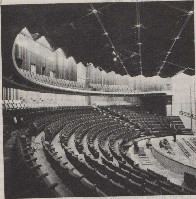
The 800-seat thrust-stage theatre.

of 120 and a full-time residential ballet-school. After the debut of Kraanerg , the company will perform on successive nights Romeo and Juliet and Erik Bruhn's Swan Lake .