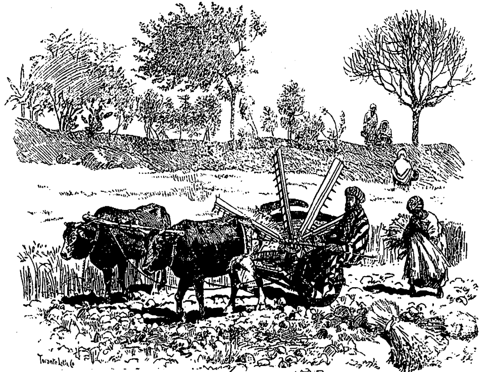
THE MASSEY HARVESTER AT WORK ON THE PLAINS OF SHARON, PALESTINE.

As one passes over this great highway between the Holy City and its seaport—a way which was so oft trodden by Bible characters—the kings, the prophets, and the saints of old; over which Roman armies, crusaders, and pilgrims by thousands have marched—his thoughts can but carry him back to historic scenes. Here and there were places and villages mentioned in Scripture—the sites where events recorded in the Holy Bible were enacted.