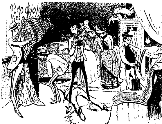
SOCIETY JOURNALISM A LA MODE.

"Oh, where did you have those lovely pictures taken—in Paris?" "Oh, no! at PERKINS' STUDIO, 293 Yonge Street." "Yes, I believe PERKINS does produce about the best work in Toronto."