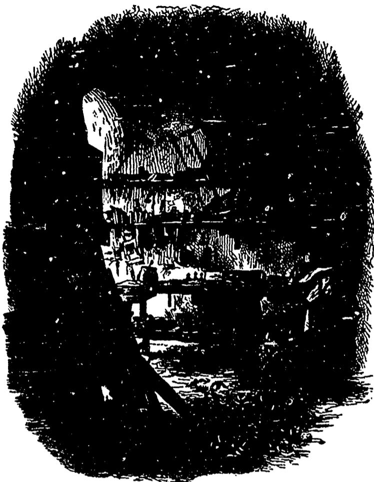
CARPENTER SHOP AT NAZARETH.