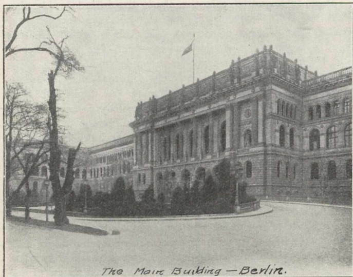
The Main Building—Berlin.

That the courses given in these institutions are varied and thorough is at once evident on glancing at any of the