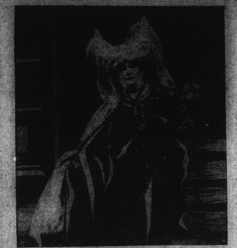
MISS ELLEN TERRY—Britain's greatest actress, who is making a farewell visit to America.

AUSTRIA-HUNGARY GROWS IN POWER Kaiser Wilhelm Said to Fear Ally May Become Too Difficult to Manage