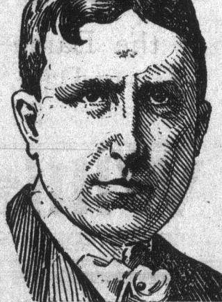
WM. RANDOLPH HEARST. Who Still Claims the Election in New York State.

Hearst Claims Election. Mr. Hearst still claims to have been elected by at least 20,000 plurality and