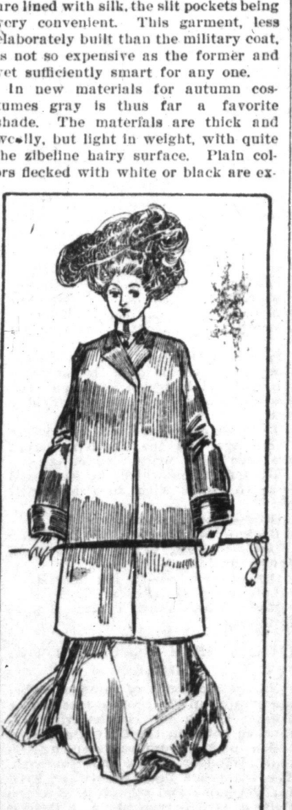
A COAT OF SIMPLE BUT SMART LINES.

In new materials for autumn costumes gray is thus far a favorite shade. The materials are thick and woolly, but light in weight, with quite the zibeline hairy surface. Plain colors flecked with white or black are ex-