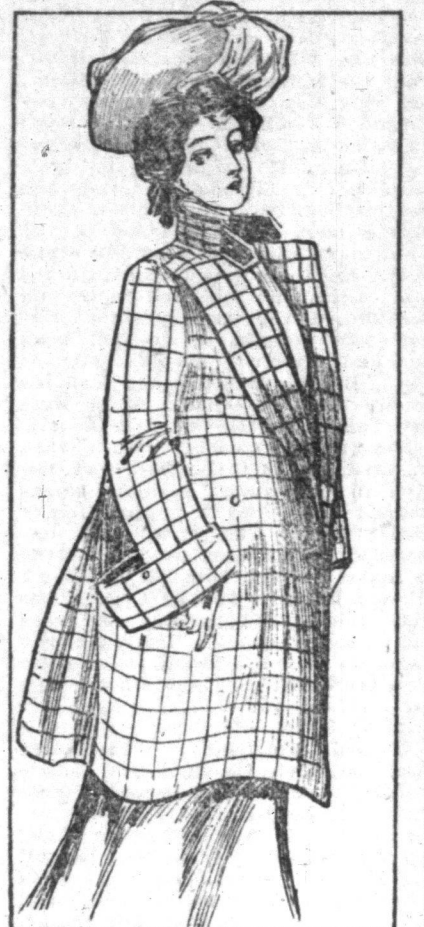
A STYLISH MILITARY COAT.

Coats for the coming season are thus particularly fascinating, one of the