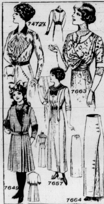
ATTRACTIVE GARMENTS FOR ALL OCCASIONS

7472A—Blouse with Robespierre Collar, 34 to 42 bust. 2 1/2 yards 36 with 3/4 yard 27 inches wide for collar, 1 yard of lace 6 inches wide for frill, 1 yard of narrower lace for wrist frills, 2 yards of lace for frills at wrists and sleeve openings as shown in back view, for medium size. 7663—Fancy Blouse, 34 to 40 bust. 2 1/2 yards 36, with 1/2 yard 21 inches wide for trimming portions, 3/4 yard 27 for girdle, 1 yard 18 for yoke and collar, 3/4 yard lace for under sleeves, for medium size. 7657—Semi-Princesse Norfolk Dress for Misses and Small Women, 14, 16 and 18 years. 4 1/4 yards 36, with 3/4 yard 27 inches wide for collar and shield, for 16 year size. 7649—Girl's Dress, 10 to 14 years. With or without Trimming in Front and Chemisette. To be worn over any Gimpie or made with Chemisette and Under Sleeves. 3 1/4 yards 36, with 1/2 yard 27 inches wide for trimming, 1 yard 18 for chemisette, 1 yard for chemisette and under sleeves. 7664—Three-Piece Skirt, 22 to 30 waist. With or without Panel, with High or Natural Waist Line. 3 1/4 yards 36, with 1 yard 12 inches wide for panel, 2 yards of braid, width of skirt at lower edge 11 yards for medium size.