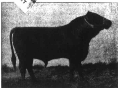
1st Prize Bull, weighing 775 lbs., 6 1/2 mo. the old.

Three prizes were given by the Carnefac Stock Food Co. for the heaviest calves fed with Carnefac. 1st Prize Bull weighed 775 lbs. 2nd Prize Bull weighed 649 lbs. 3rd Prize Bull weighed 526 lbs.