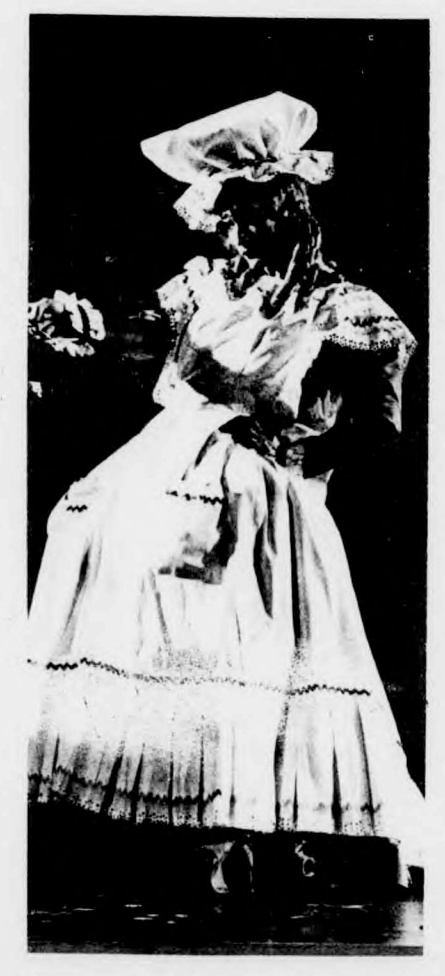
The young and lively Joffrey Ballet at the Royal Alex.