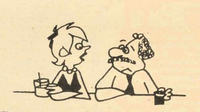
"No, I don't think success makes a woman masculine, professor. - Did yours make you feminine? (Thanks to the Women's Centre of Samla, Ontario.)

"The long range problem, however, is the basic problem that is evident throughout society that when women have to compete with men they invariably back off, due to the socialization process, and