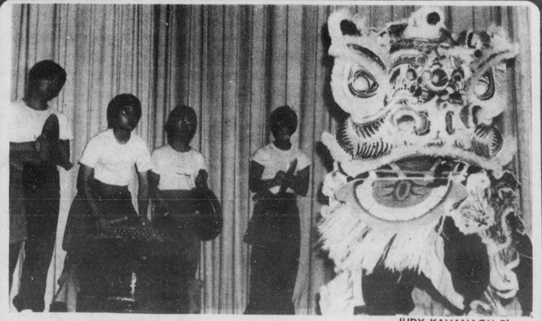
The Chinese New Year Festival was celebrated last Saturday.