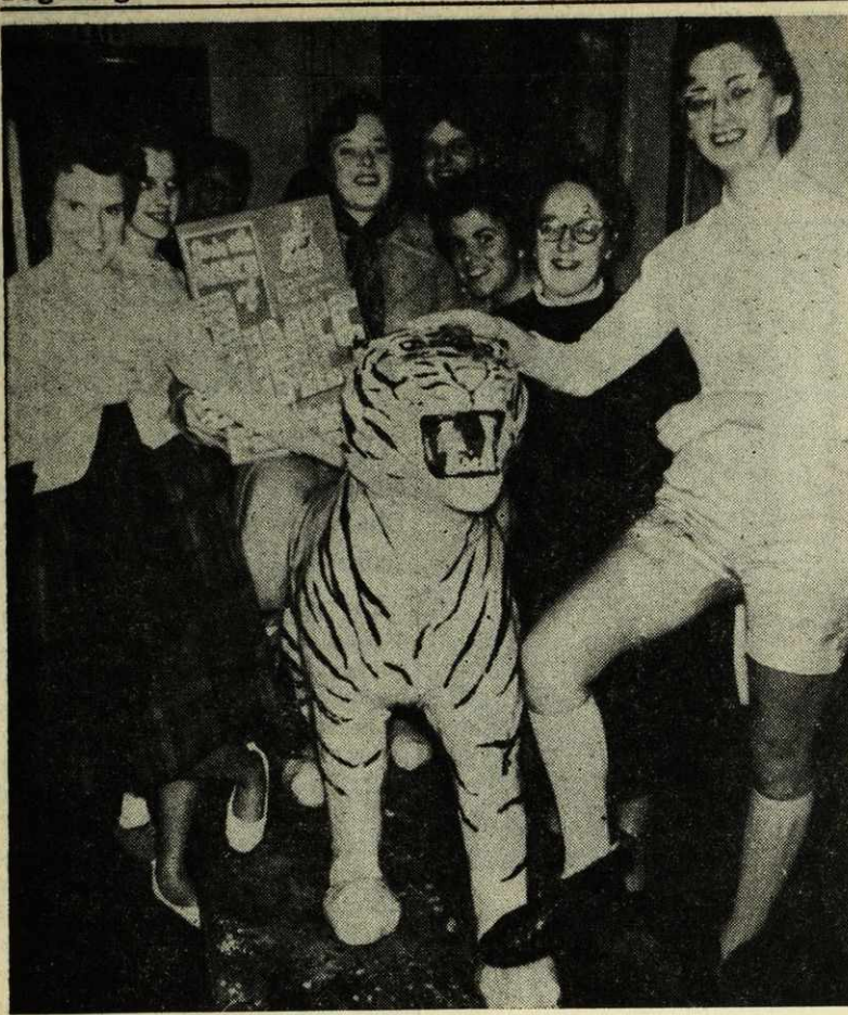
The picture above (recently smuggled out of Shirreff Hall) shows you know who guarding you know who from the ravages of Tech last week. The Tiger was placed in the middle of the hall while the girls spent the night in hopeful anxiety around him.