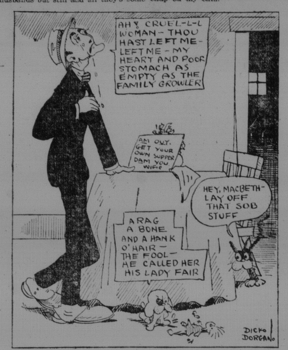
Stabbed to the quick I at 1st felt like settling down and haveing a good cry."