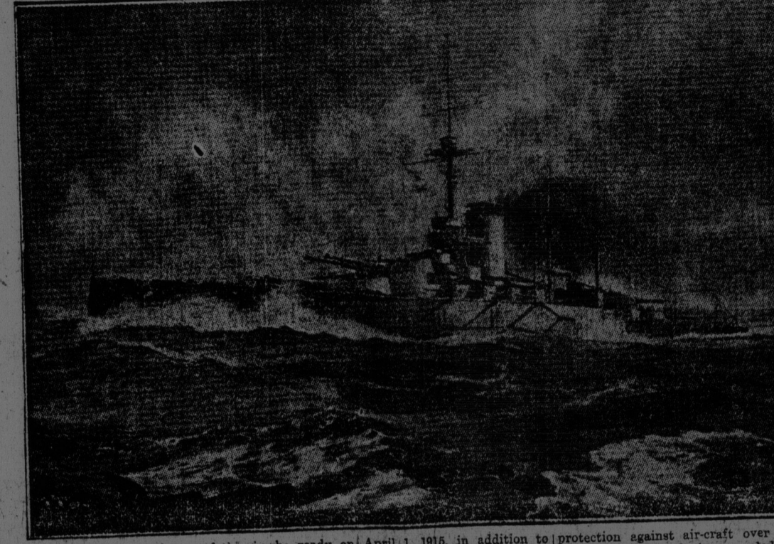
The "Queen Elizabeth" is one of the six ready on April 1, 1915, in addition to the twenty-nine Great Britain would be on April 1, 1914. A novelty will be...