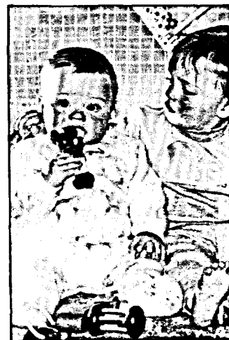
Child with plastic toy

Toys. All too often one hears of a child choking on a plastic toy. The problem is that most plastics don't show up on x-rays. Mattel Toy Inc. has just found a way of mixing barium sulfate in powder or liquid form into the plastic to make it visible. The process sounds easy, but it took five years of research to find a material that was harmless in itself, yet compatible with plastics and economically feasible. Mattel is now offering the formula free of charge to other plastics manufacturers.