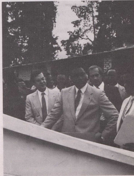
Mr. De Bané (left) and Rwanda's President Juvénal Habyarimana (centre) visit the University of Rwanda.