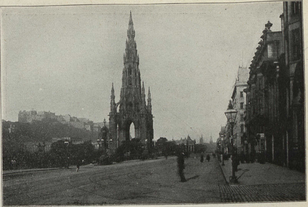
SCOTT'S MONUMENT, EDINBURGH—SHOWING PRINCE'S STREET AND THE CASTLE IN THE REAR.