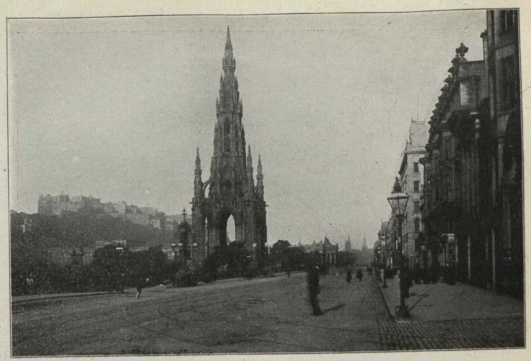
SCOTT'S MONUMENT, EDINBURGH—SHOWING PRINCE'S STREET AND THE CASTLE IN THE REAR.