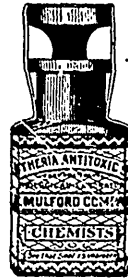
(Package most convenient; absolutely sterile.)