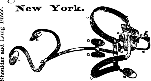
Fig. No. 14. Improved Centripetal