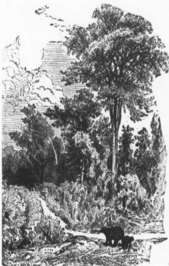
IN OUR NORTHERN FORESTS.