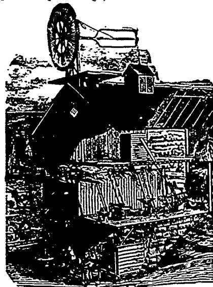
Geared Wind Mills, for Driving Machinery, Pumping Water, etc. From 1 to 40 horse power.