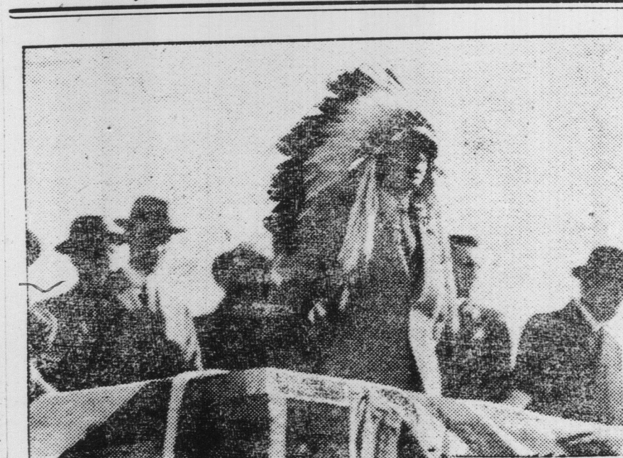
The Prince Wearing Indian War Bonnet at Banff

The Valley Real Estate Agency, Wolfville, N.S.