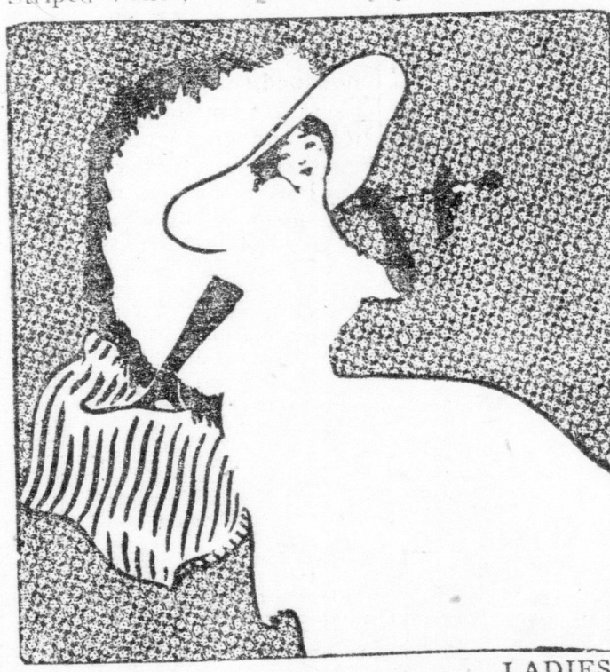
LADIES' READY-TO-WEAR, SECOND FLOOR.

Our complete showing of dainty Summer Dresses is now on display in Ready-to-Wear Section, Second Floor, Cotton Voile, Marquise, Embroidery and fine Mull, prettily trimmed with lace and insertion, etc.—Some handsome dresses are shown in Striped Voiles, which are very popular this season.