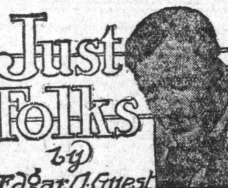
Edgar A. Guest

Soper & Moore Wholesale Importers and Jobbers.